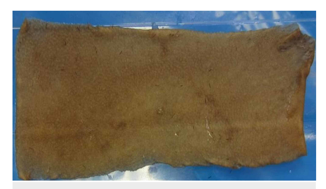
FIGURE 3: Scalp STSG after Dermabond depilation

Most of the hair was removed with one application of Dermabond. The few remaining hair fragments were easily removed upon rinsing the graft in saline. No graft sustained any punctures or tears indicative of mechanical injury. Each graft was rinsed again to ensure that any residual hair fragments or particles of Dermabond were removed. This resulted in an STSG of the scalp, devoid of any embedded hair and mechanical damage (Figure.3). The depilated grafts were then grafted to the recipient site.